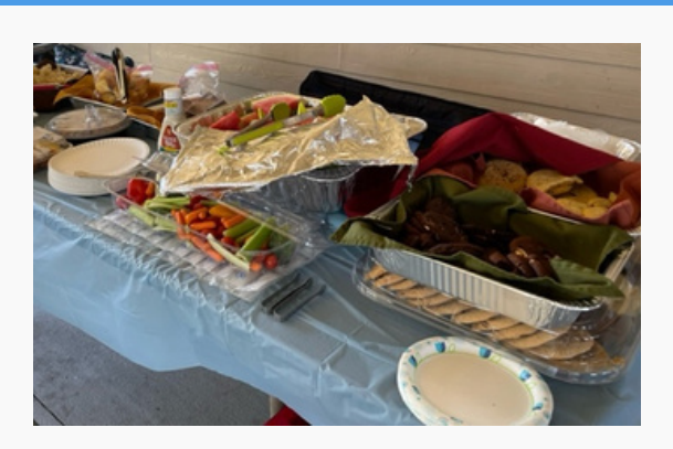
More pictures on Facebook!