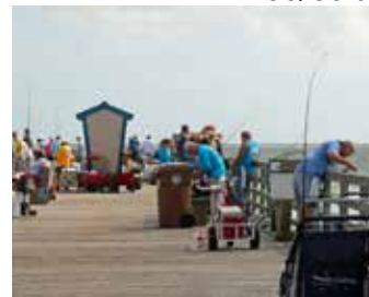
Even with the high winds and rough seas, there was a great turn out