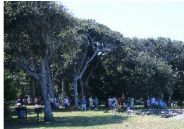
Casting contest could not have been held at at more beautiful park - Herschel King.