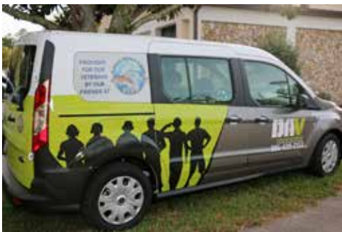
Part of the money went to adding the Flagler Sportfishing Club Logo on 2 of their vehicles.