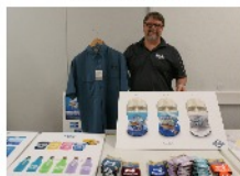
Club sponsor, Daytona Sportswear displayed some of the items available to the Club.