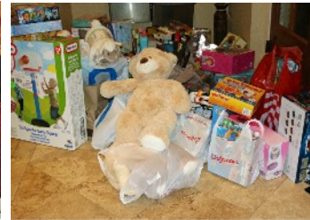
SOME OF THE "TOYS FOR TOTS" DONATED BY GUESTS AT THE CHRISTMAS PARTY