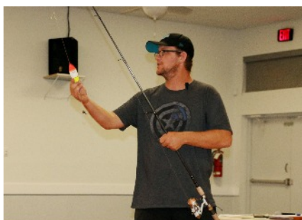
When target fish is Trout, Spencer uses a float on a longer leader with free swimming shrimp.