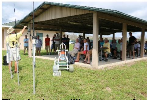
The shady pavillion was perfect for the outside presentations.