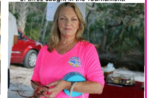
Thanks goes out to Patricia Albano for selling 50/50 raffle tickets at the Tournament.