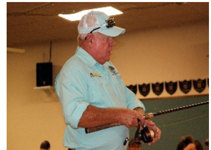
A good tip is to open the bail when you first feel a fish and to untangle your line under a dock.