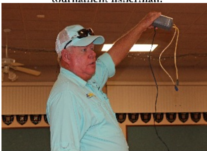
To keep bait alive, use an electric pump and put a bottle of frozen salt water in the well/bucket.