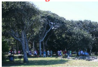
Casting contest could not have been held at at more beautiful park - Herschel King.