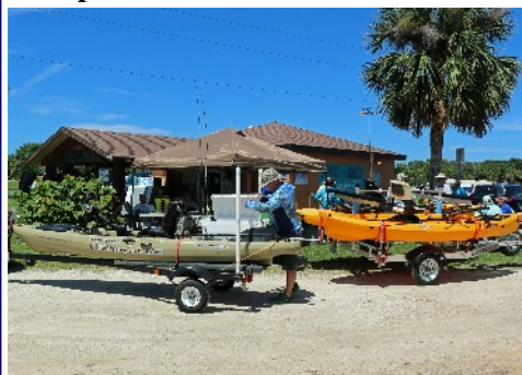
Kayak Tournament Site