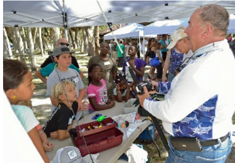
Learning What's Needed and Safety