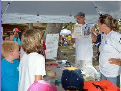
Learning About Conservation