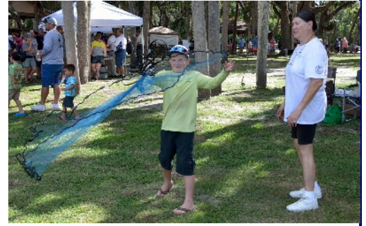
Learning to Throw a Cast Net