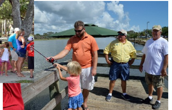
Kids Fished from the Pier