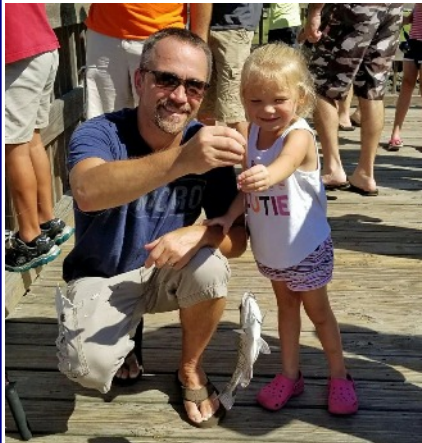
Proud Young Angler and Dad