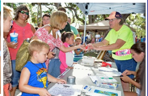
Kids Received a Raffle Ticket To Have a Chance to Fish in the Kids Invitational Tournament