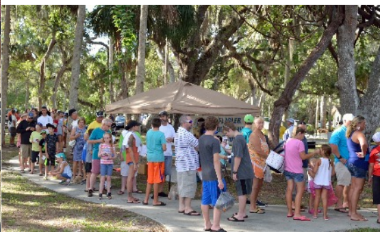
Another Great Turn Out This Year. Thanks to All Who Helped!