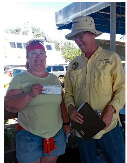
5 th Scheyenne Welch 1 lb 15 oz Porgy