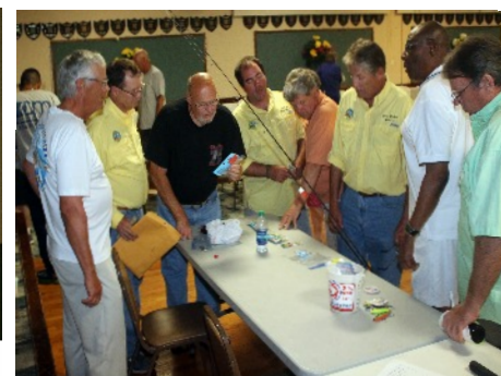
Bill's presentation was so interesting that members hung around after the meeting for "Moore"