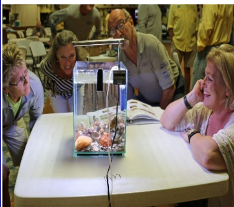
Members are delighted by the biodiversity in the tank supplied by Whitney Lab's Oyster Reef Restoration's team.