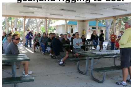
New Members Clinic at Herschel King Park had a very good turn out.